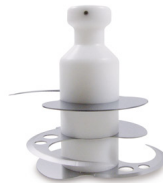
Shaft with knives for pesto sauce