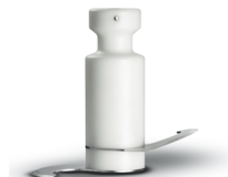
Shaft with knives to mix dough