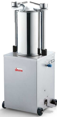
Sirman SaUsage Stuffers , model IS 25 Idra :

Sirman Spa Viale dell'Industria 9/11 35010 PIEVE DI CURTAROLO (PD), Italy Tel./Fax. +39 049 9698666 / +39 049 9698688 email: info@sirman.com