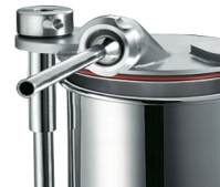
Bush in stainless steel, optional