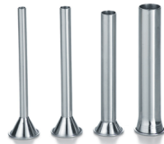
Funnels s/s ø 13-16-20-38 optional