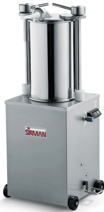
Sirman SaUsage Stuffers , model IS 25 Idra :

Sirman Spa Viale dell'Industria 9/11 35010 PIEVE DI CURTAROLO (PD), Italy Tel./Fax. +39 049 9698666 / +39 049 9698688 email: info@sirman.com